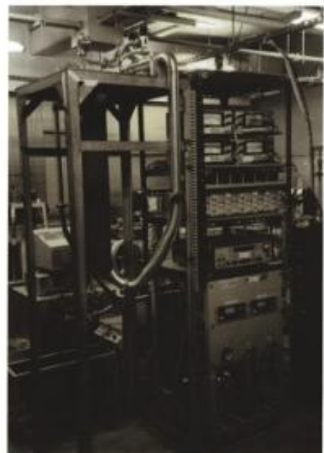
High precision adiabatic calorimeter

Excess heat capacity and dielectric constant anomaly due to the formation of polar nano region in relaxors